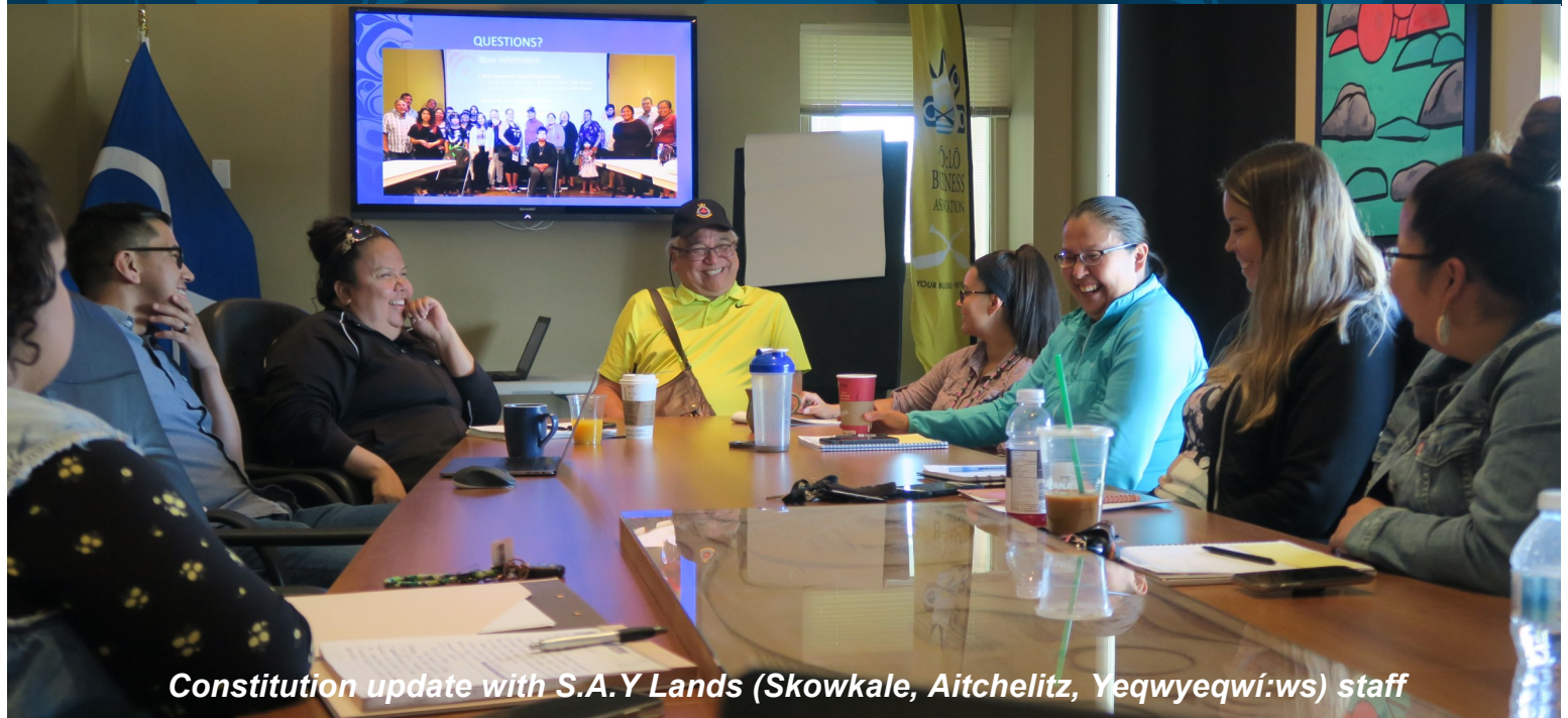
Constitution update with S.A.Y Lands (Skowkale, Aitchelitz, Yeqwyeqwi:ws) staff

S'ólh témexw te ikw'elò. Xólhmet te mekw'stám it kwelát. This is our land. We have to take care of everything that belongs to us.