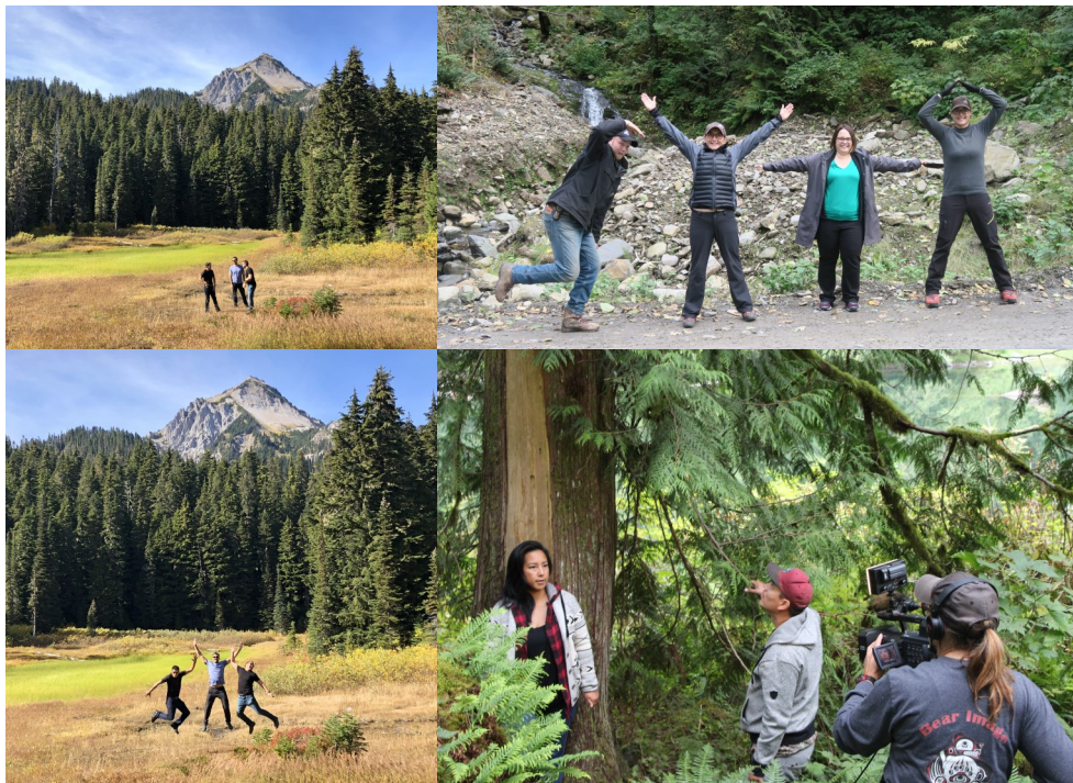
Left top and bottom: Action on Mt. McGuire. Right top: SXTA members in Skawahlook lands. Right bottom: Filming at Foley Lake.

Subscribe to our Youtube Channel and Like us on Facebook now so you don't miss out.