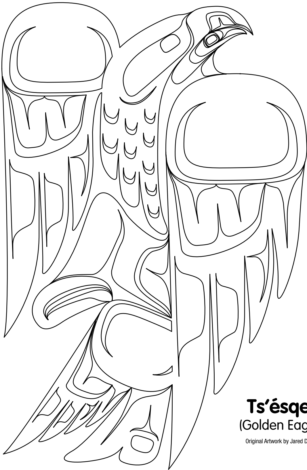
Ts'ésqel (Golden Eagle)