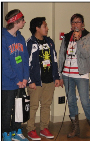
SXTA Youth Forum 2014

Excerpt from Stó:lō Declaration, 1975 which is included in the "Stó:lō Xwexwilmexw Constitution" Draft, September 2013