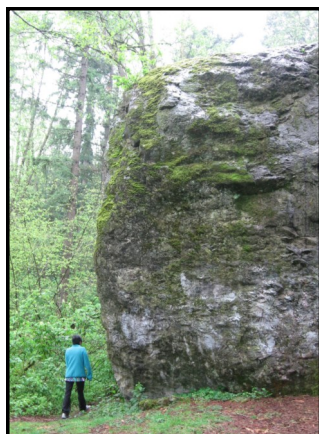
SXTA Downriver Tour, Méqsel Rock

Leq'á:mél Community Centre 43101 Leq'á:mél Way 5:30pm Dinner